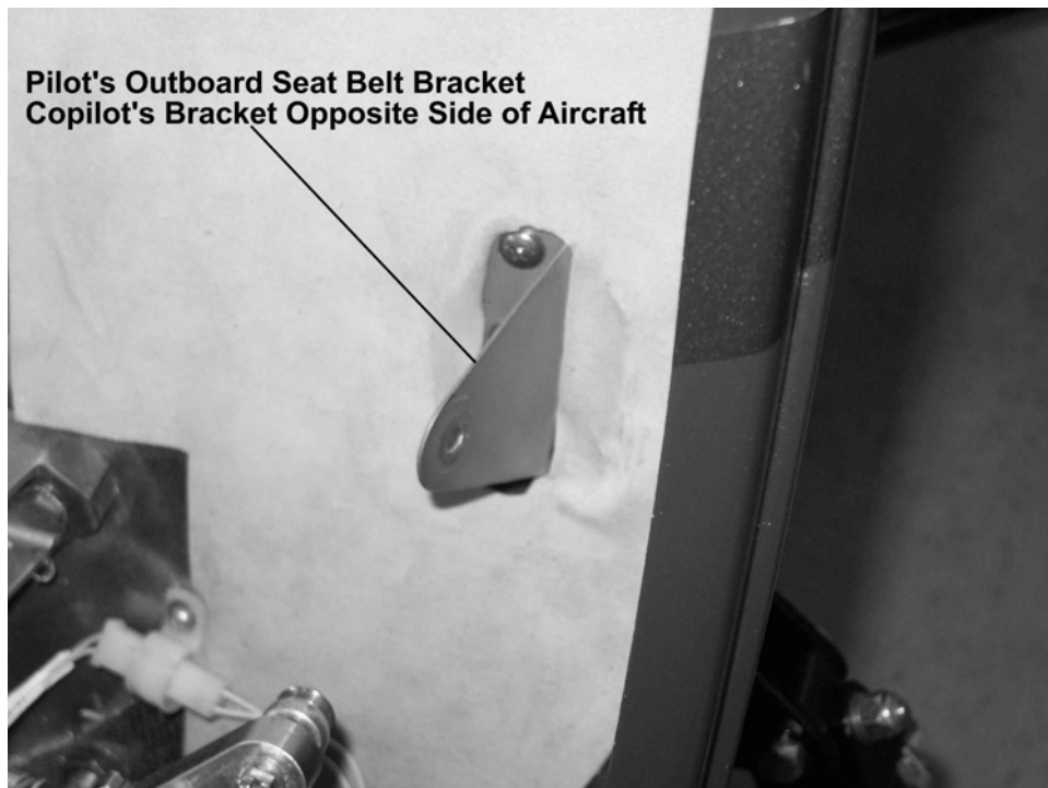
Figure 1. Seat Belt Bracket Location