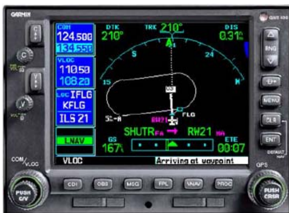
Figure 7-3. GNS 530W Display