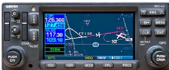
Figure 7-2. GNS 430W Display

3. Two front-loading datacard ports are used for the Jeppesen and terrain database updates.