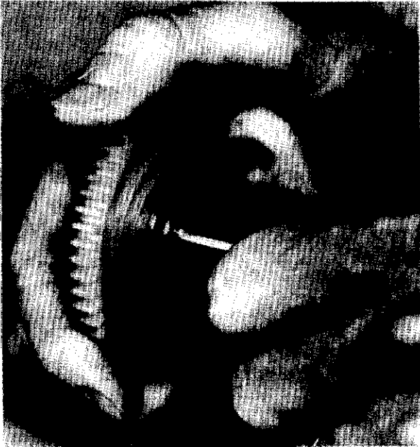
Figure 3. Checking for Loose Electrode